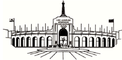
SITE OF 1932 AND 1984 OLYMPICS ATHLETICS COMPETITION OPENING & CLOSING CEREMONIES